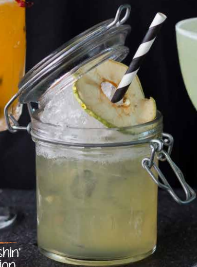
Appley Ever After